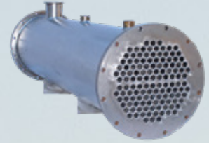
Heat Exchangers & Condensers