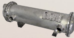
Jacket Water & Gear Box Coolers