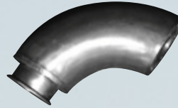
Wet Exhaust Elbows