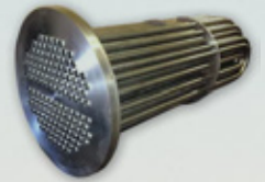
Bayonet Oil Coolers