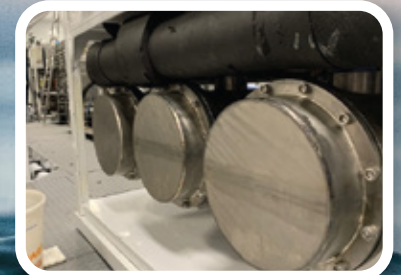
A/C Condensers (Titanium)