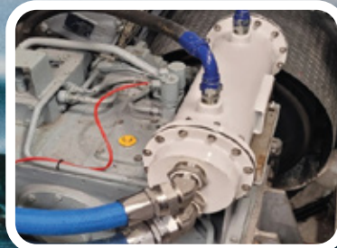
Gear Box Coolers (Titanium)